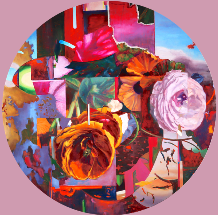
Kintsugi: Arrangement no. 1, 2024; Oil on aluminum panel, 48" diameter Thuan Vu, Courtesy of the Artist Photo credit: Isabel Chenoweth